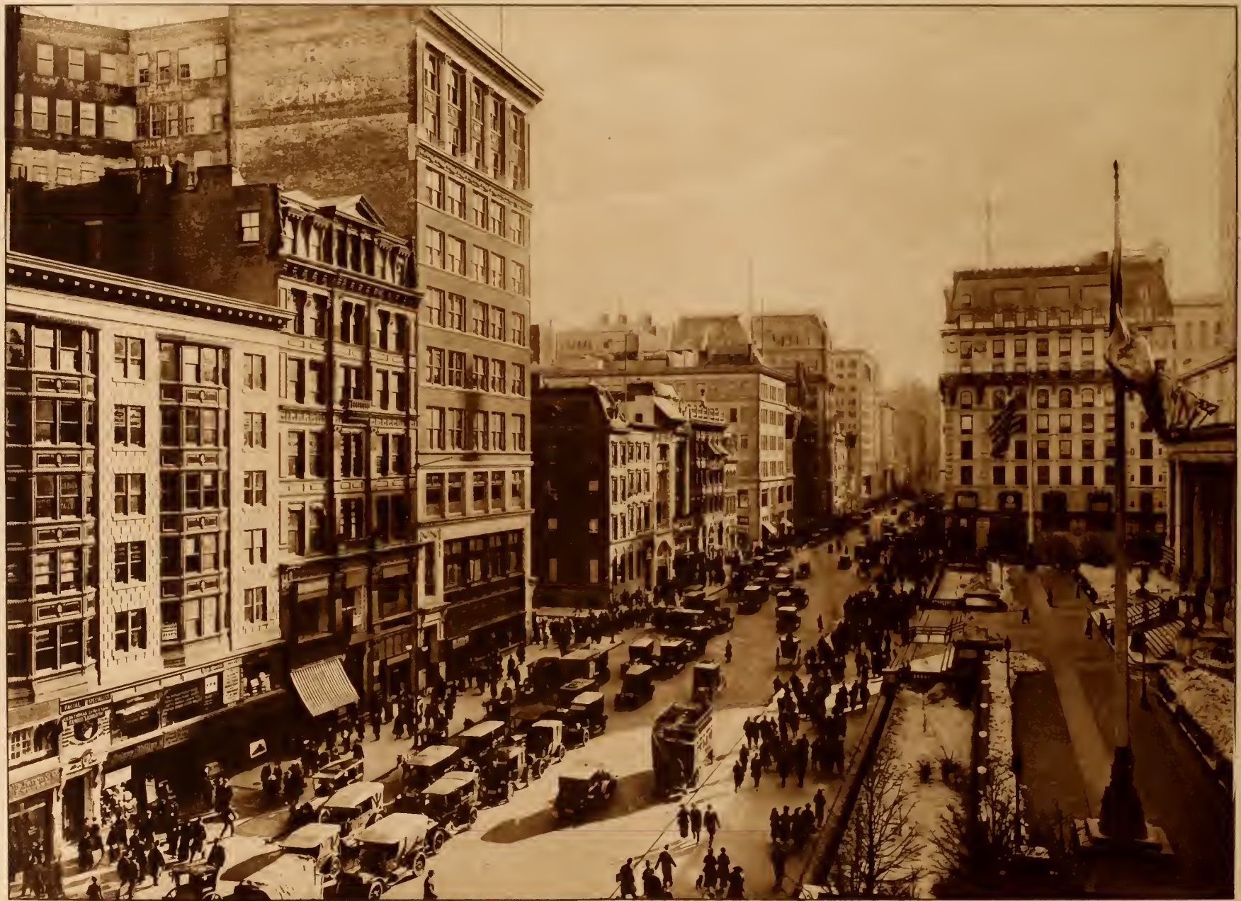
FIFTH AVENUE LOOKING SOUTH FROM 42ND STREET. This corner is one of the busiest in the world. At one time it was graced by the homes of New York's Four Hundred. It is no longer a residential section. This part of Fifth Avenue is facing the New York Public Library and is representative of New York life.